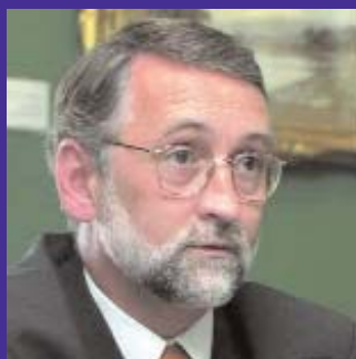
Peter Peacock MSP

European investment in the economy and infrastructure of Scottish Borders and Dumfries and Galloway continues with the announcement that a further £9.3 million has been approved for projects across the South of Scotland. This follows on from the £6.5 million announced last April.