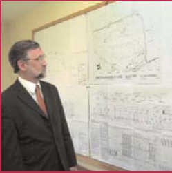
Peter Peacock MSP

The show ground is a focal point for any market town and Springwood Park is one of the cornerstones of Kelso's economy. Border Union Agricultural Society, a largely voluntary body that has managed Springwood Park since the early nineteenth century, developed its plans to enhance the show ground's facilities in 1999. It has worked in close conjunction with Scottish Borders Council, Scottish Enterprise Borders, Scottish Borders Tourist Board and SOSEP to achieve this end.